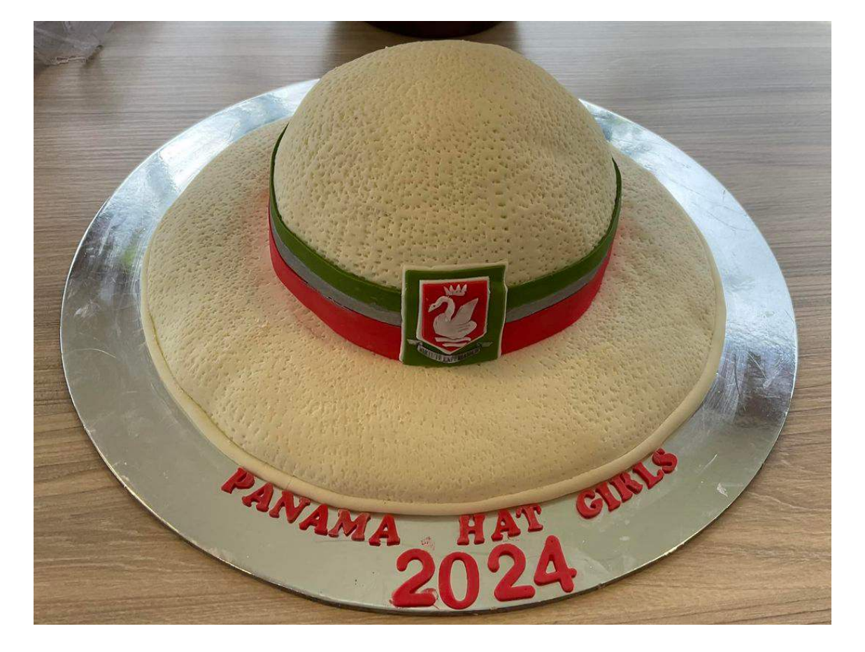
The famous Westlake 'Panama Hat' - as a cake!