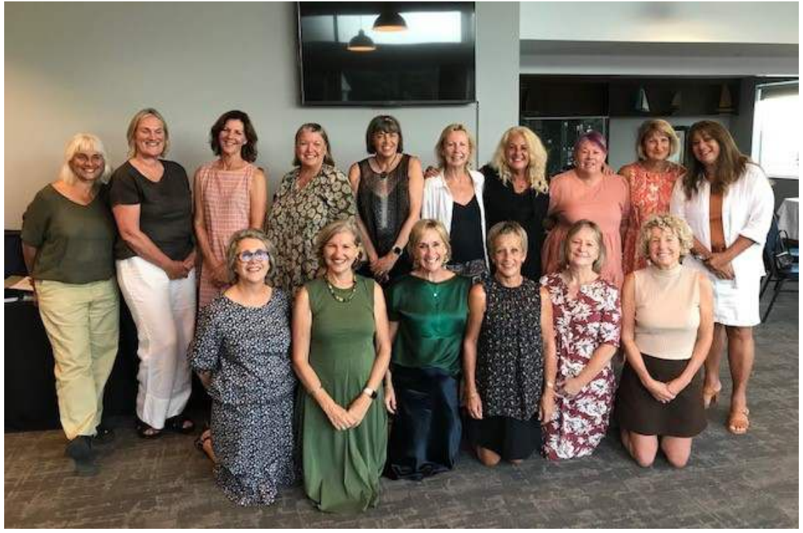
Class of 1977 Reunion