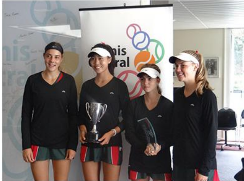
Westlake - 2015 National Tennis Champions

Tennis players at Westlake are fortunate these days to have access to great sporting facilities including the Covered Courts.