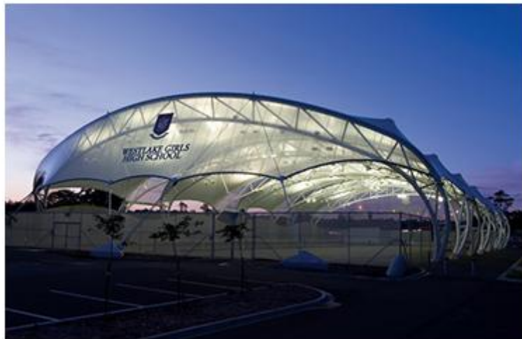
The Covered Courts facility for tennis and netball

Tennis players at Westlake are fortunate these days to have access to great sporting facilities including the Covered Courts.