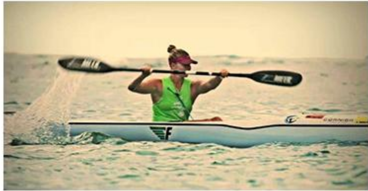
The 2014 Molokai Championship